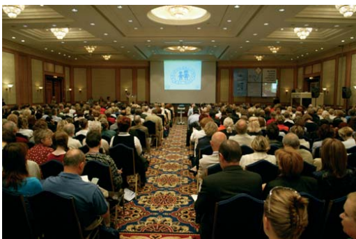
The plenary room on the first conference day

The conference participants were also invited to visit the Foundation's "Mazowiecka" Help Center for Children.