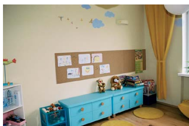
A child-friendly interviewing room and a therapeutic room for young children

The "Mazowiecka" Center was renovated and equipped with funds provided by: