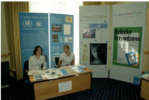
The Nobody's Children Foundation's exhibition stand