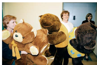
Representatives of the State Agency for Solving Alcohol Problems (PARPA) with a family of Parpa Bears