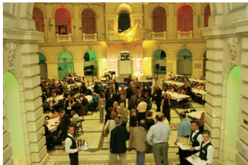
The banquet at the Warsaw University of Technology